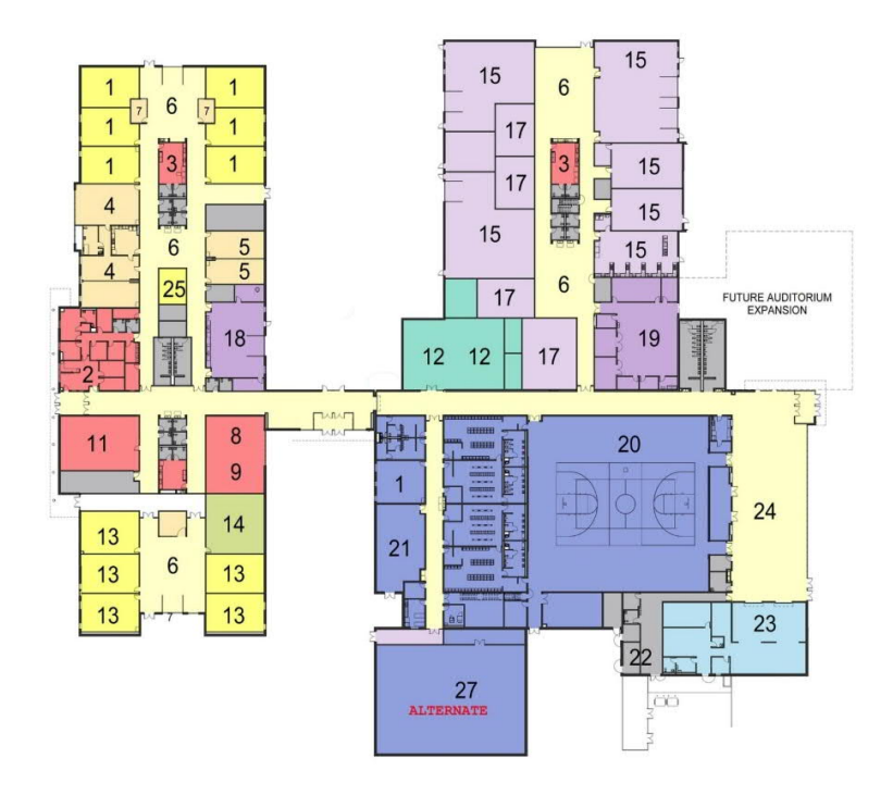
Figure 2: Conceptual Floor Plan - 1st Floor

New Camden County High School Camden County, NC